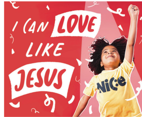
MARCH | JESUS TAUGHT US HOW TO LOVE OTHERS