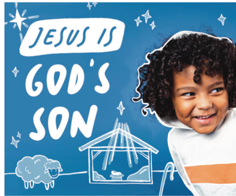
DECEMBER | JESUS, GOD'S ONLY SON, CAME TO SHOW US HOW MUCH GOD LOVES US