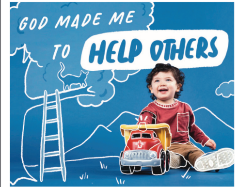
MAY | PEOPLE IN THE BIBLE SHOW US DIFFERENT WAYS GOD MADE US TO HELP