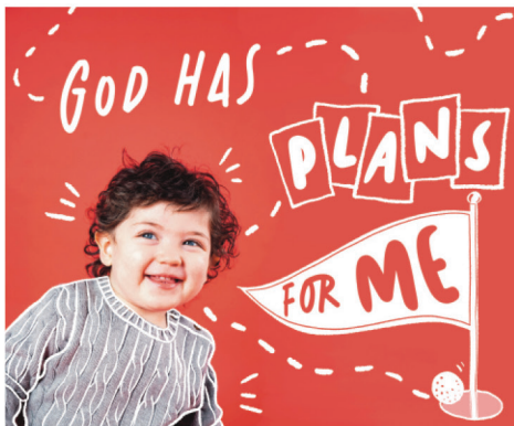
OCTOBER | NOAH AND JOSEPH SHOW US WE CAN TRUST GOD'S PLANS, EVEN WHEN IT'S HARD