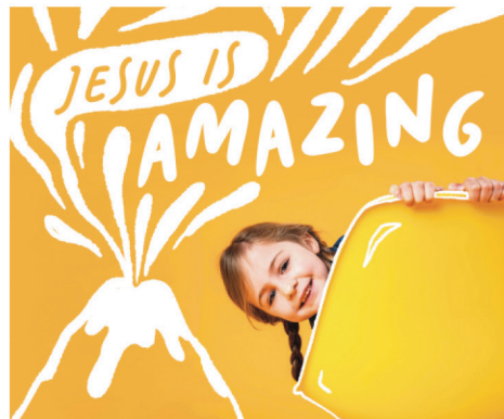
JANUARY | WE LEARN THAT JESUS SAID AND DID AMAZING THINGS