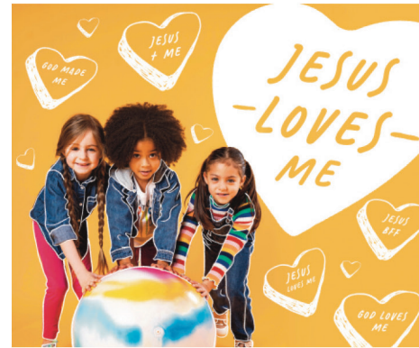
FEBRUARY | EVERYTHING JESUS DID SHOWS US HOW MUCH HE LOVES US