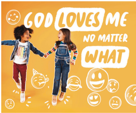
SEPTEMBER | WHEN WE READ ABOUT PEOPLE IN THE BIBLE IT REMINDS US THAT GOD LOVES US