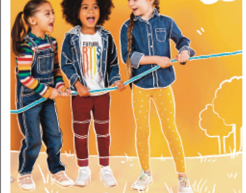
JUNE & JULY | PETER AND PAUL SHOW US HOW JESUS WANTS TO BE OUR FRIEND