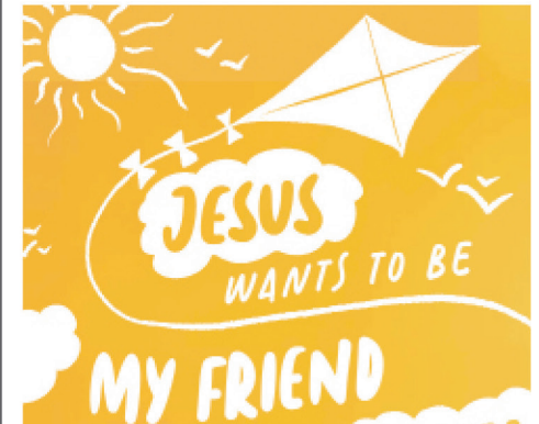
JUNE & JULY | PETER AND PAUL SHOW US HOW JESUS WANTS TO BE OUR FRIEND