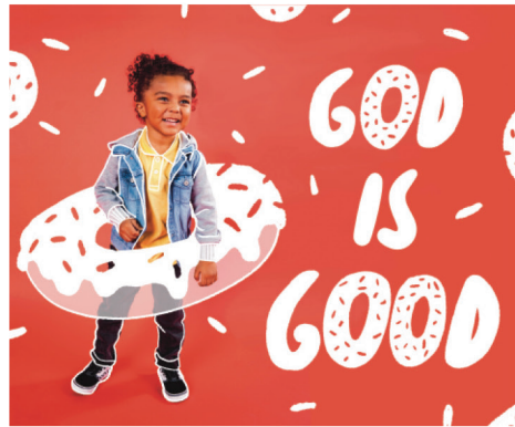
NOVEMBER | GOD SHOWS GOODNESS TO ELIJAH, MOSES, AND NEHEMIAH