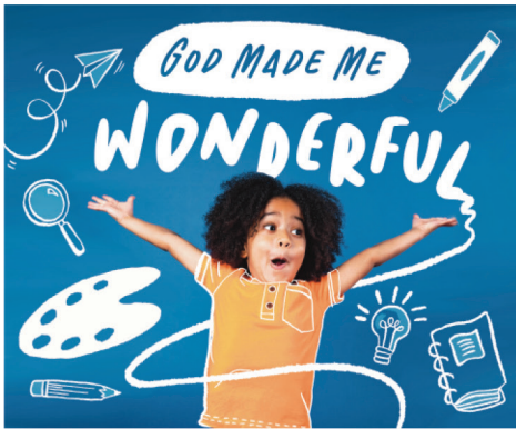
AUGUST | THE CREATION STORY SHOWS US WE ARE WONDERFULLY MADE IN THE IMAGE OF GOD