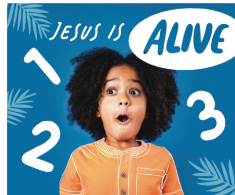
APRIL | WHAT JESUS DID, MEANS HE CAN BE YOUR FRIEND FOREVER